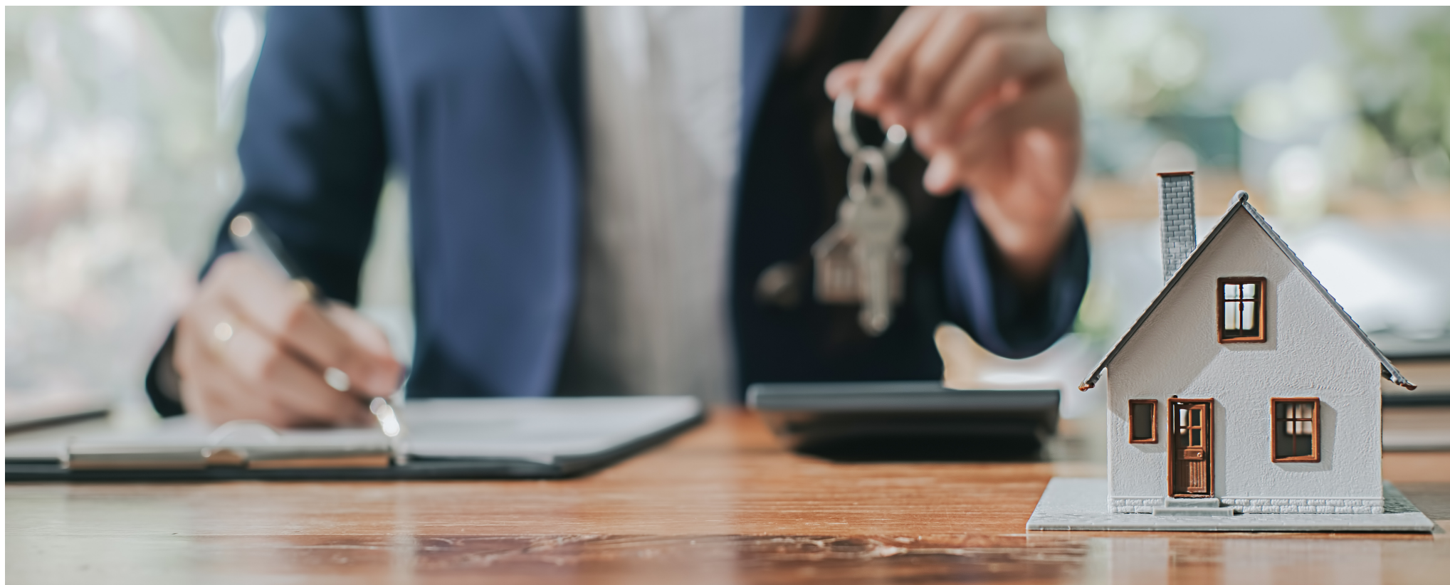
Mortgage Delinquency Rates

WE PROVIDE A UNIQUELY SUCCESSFUL SKIP TRACING SERVICE, WHICH NOT ONLY EXCEEDS COMPETITORS RESULTS BUT ALSO RESPONSIBLY REDUCES RISK FOR OUR CLIENTS. OUR FIRM FOCUSES ON DELIVERING LIVE, OVER THE PHONE CONTACT BETWEEN LENDERS/SERVICERS AND THEIR HARD-TO-REACH RIGHT PARTY CONTACTS. OUR HIGHLY TRAINED PROFESSIONALS MANUALLY LOCATE, CONTACT, & TRANSFER THE RIGHT PARTY CONTACT INTO OUR CLIENT'S COLLECTIONS/RESOLUTIONS CONTACT CENTER. OUR SERVICE RESULTS IN AN EXTRAORDINARILY HIGH CONVERSION RATE AND ALLOWS OUR CLIENTS TO COME TO A POSITIVE RESOLUTION, WHILE MAKING SURE WE OBSERVE OUR INDUSTRY'S COMPLIANCE REGULATIONS.